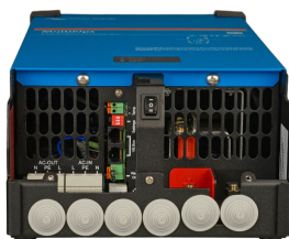
MultiPlus 2000 VA (bottom cover removed)